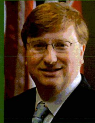
Tate Reeves Lt. Governor

During Wednesday's luncheon, Mississippi's Lieutenant Governor Tate Reeves will speak to conference attendees. Lt. Governor Reeves will focus the 52-member Senate with a focus on keeping government spending under control, reforming education and making Mississippi a better place to raise a family.